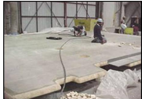
Left and Center: Examples of composite structures during the resin infusion process.